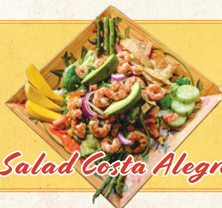
Salad Costa Alegre