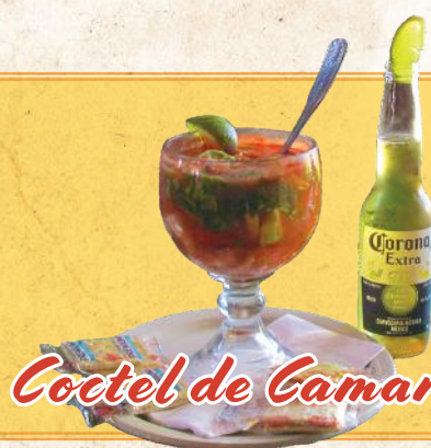
Coctel de Camaron