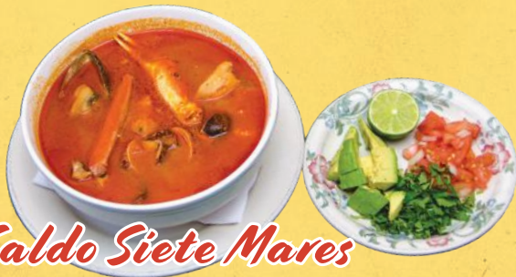
Caldo Siete Mares

Sopa de Camarones $25.95 Shrimp served in a special soup with vegetables. Served with onions, tomato, avocado, lime and your choice of warm tortillas.