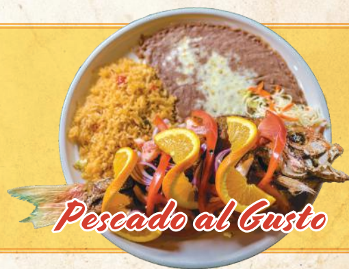
Pescado al Gusto

Our food is cooked to order. Consuming raw or undercooked meats, poultry, seafood, shellfish or eggs may increase your risk of foodborne illness, especially if you have certain medical conditions.